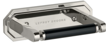
MK 4650 MACKINTOSH PAPER HOLDER