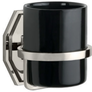
MK 4654 MACKINTOSH CERAMIC MUG HOLDER