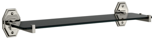
MK 4666 MACKINTOSH BLACK GLASS SHELF