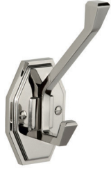
MK 4656 MACKINTOSH ROBE HOOK