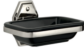
MK 4652 MACKINTOSH CERAMIC SOAP DISH