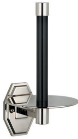
MK 4651 MACKINTOSH SPARE PAPER HOLDER