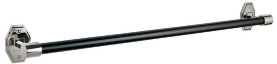
MK 4659 MACKINTOSH 24" TOWEL RAIL