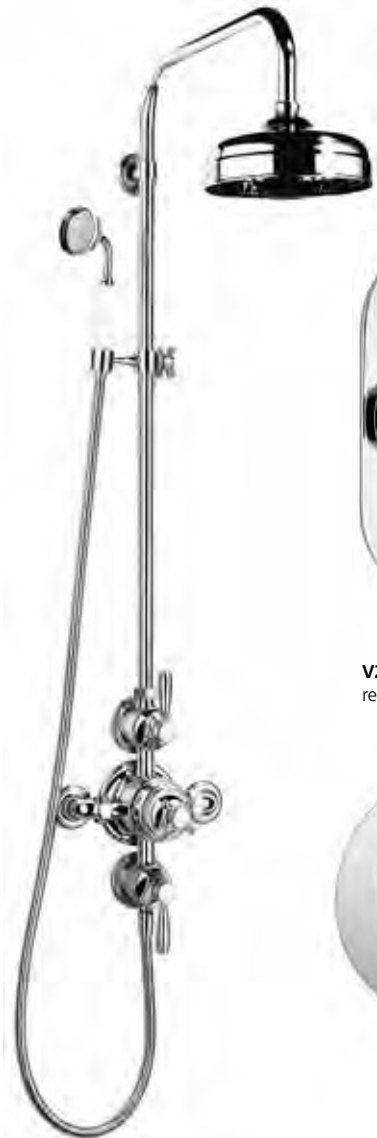
V2K1 V2K6 (V2K1 Valve WRAS Approved in UK) Other configurations are available