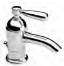
V2K08 (WRAS Approved in UK)