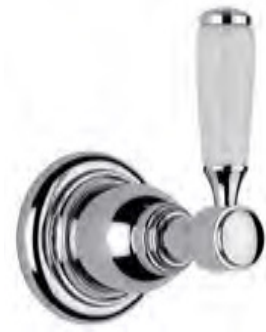
Ceramic lever - C