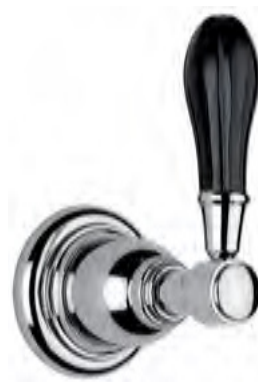
Black organic crystal lever - GB