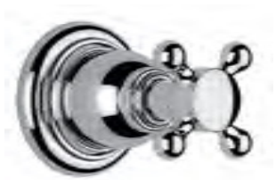
Cross top - X