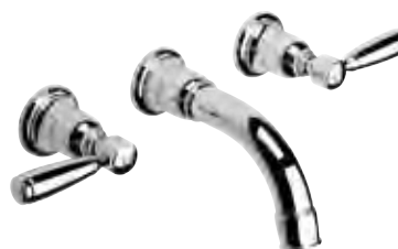
V2K17 Requires wall installation kit (WRAS Approved in UK)