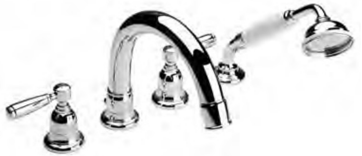
V2K48 (WRAS Approved in UK)