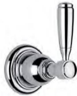
Metal lever - M