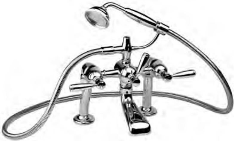
V2K30 spout = 185mm - 225mm long V2K31 spout = 252mm - 292mm long Freestanding legs are available (V2K30 WRAS Approved in UK)