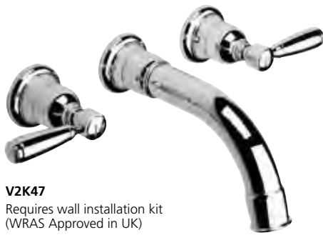
V2K47 Requires wall installation kit (WRAS Approved in UK)