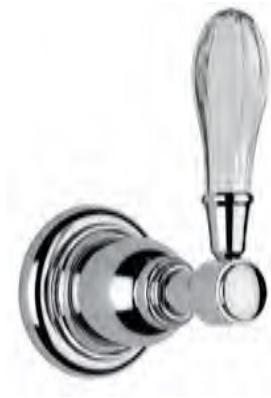
Clear organic crystal lever - GC