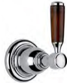
Wood lever - W