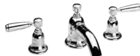
V2K14 spout = 140mm long V2K15 spout = 170mm long (WRAS Approved in UK)