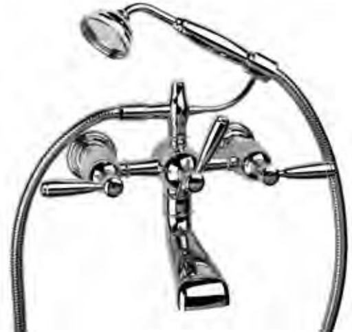
V2K32 spout = 208mm long V2K33 spout = 276mm long