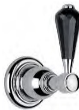
Black geometric crystal lever - SB