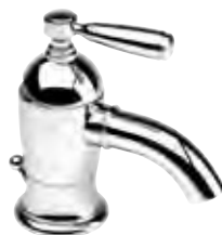
V2K09 (WRAS Approved in UK)