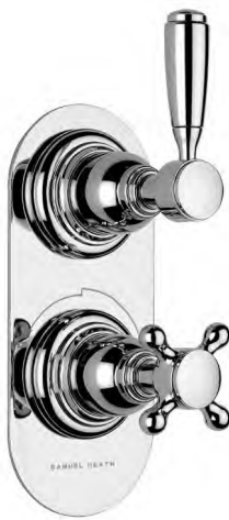
V201-T requires V134-IS (WRAS Approved in UK)