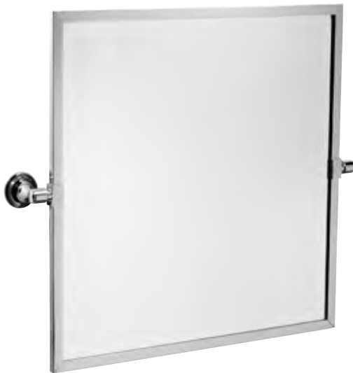
N9560 600mm x 600mm