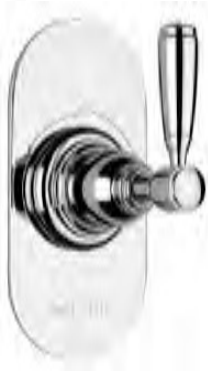
V200-T2 requires V133-IS