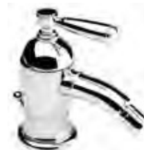
V2K19 (WRAS Approved in UK)