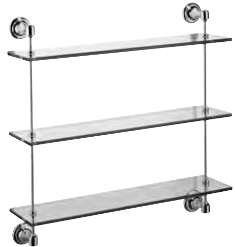
N9545 562mm x 610mm