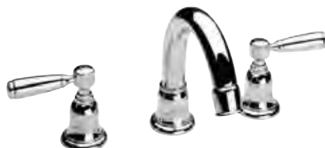
V2K16 (WRAS Approved in UK)