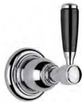
Gloss black chrome lever - GBC