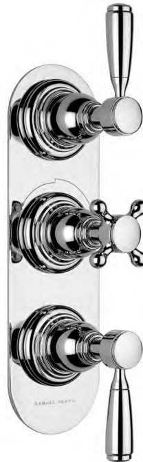
V202-T V203-T V202-T requires V135-IS (WRAS Approved in UK)