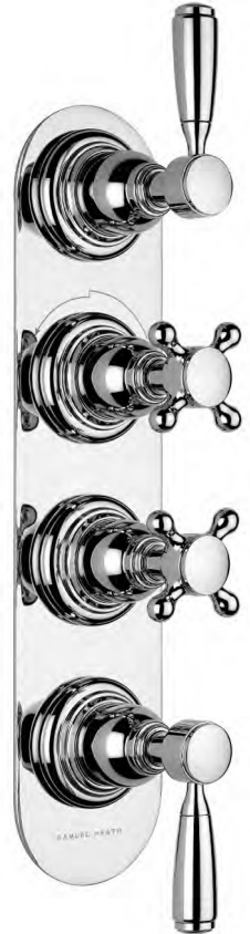
V206-T2 requires V606-IS (WRAS Approved in UK)