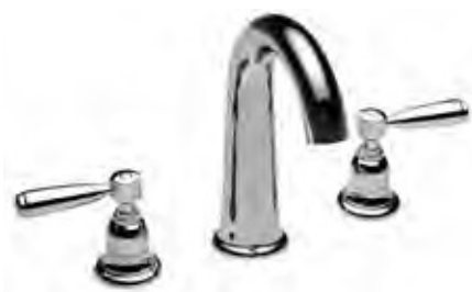
V2K12 (WRAS Approved in UK)