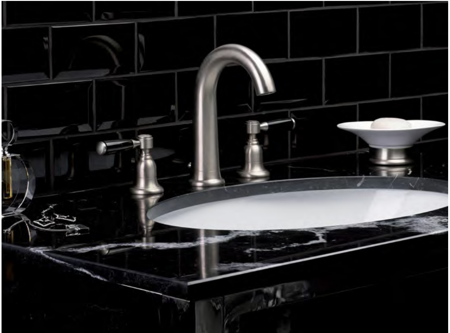
V2K12GBC in SSF stainless steel finish with gloss black chrome levers

Fairfield taps, showers and bathroom accessories are a balanced combination of the diverse formal design influences of the Arts and Crafts and Aesthetic Movements which flourished between 1880 and 1910