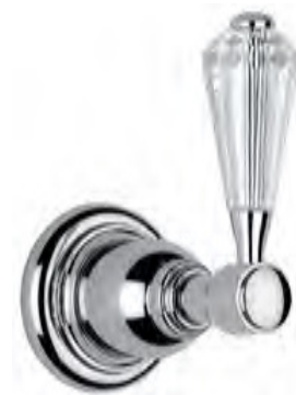
Clear geometric crystal lever - SC