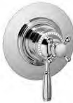
V261-T requires V161-IS (WRAS Approved in UK)