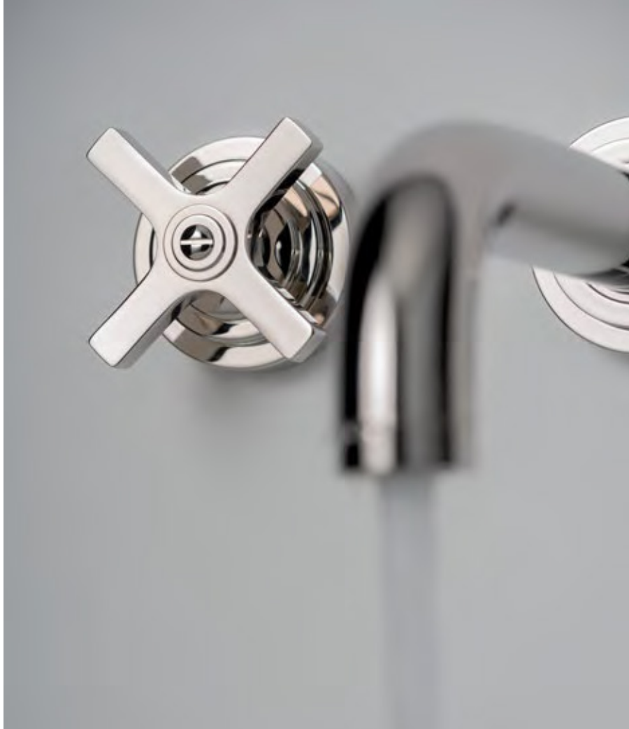
V7K17-2XF Wall mounted basin mixer in PN polished nickel finish