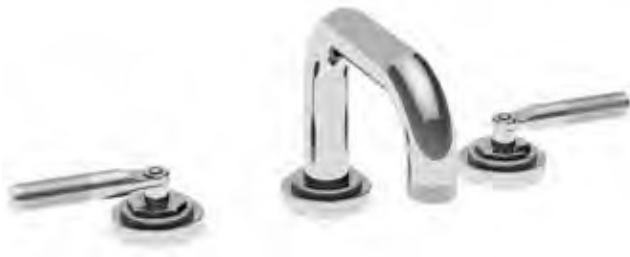
V7K14LK (illustrated) V7K14XK (with cross tops) Low spout = 139mm high (WRAS Approved in UK)