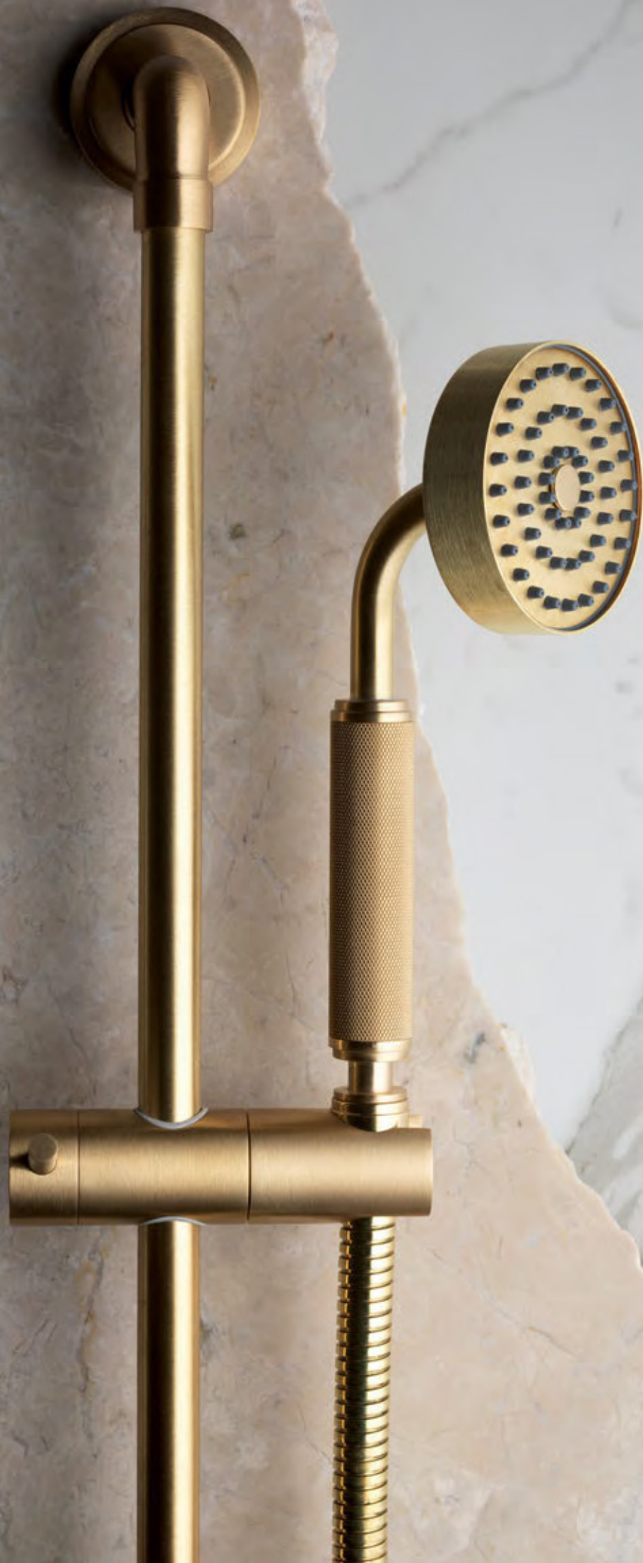
V770-KITK Slider rail kit in URB urban brass finish