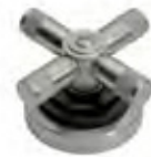
SSB Stainless steel finish with matt black chrome