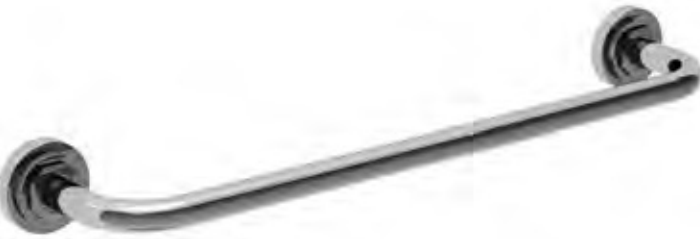
N7655K 457mm N7655K-A 610mm N7655K-B 800mm