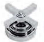
CP Chrome plate