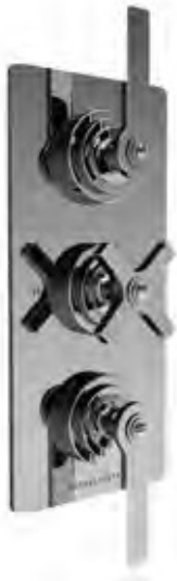
V702-TLF V703-TLF V702-TLF requires V135-IS (WRAS Approved in UK) V703-TLF requires V132-IS