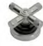
SSB Stainless steel finish with matt black chrome