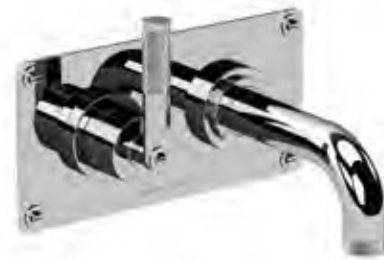
V7K20-1LK-LH (illustrated) V7K20-1LK-RH Right handed version also available Spout = 144mm long