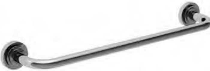
N7655F 457mm N7655F-A 610mm N7655F-B 800mm