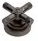
CTB City bronze