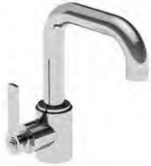
V7K09LF-LH (WRAS Approved in UK)