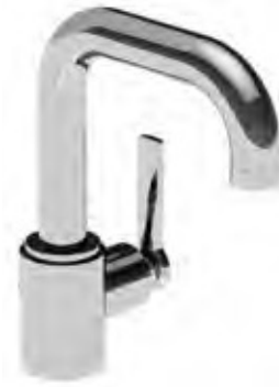
V7K09LF-RH (WRAS Approved in UK)