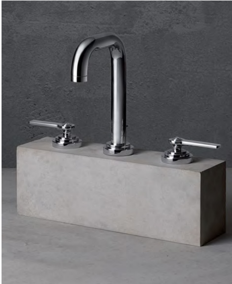
V7K16LF 3 hole basin mixer, high spout with pop-up waste in CP chrome plate finish