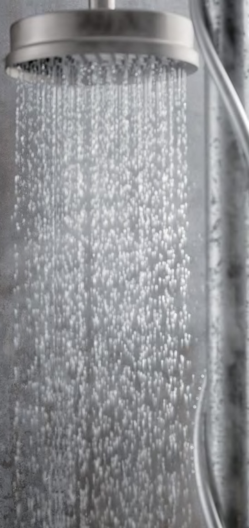
V702-TLK Twin control thermostatic shower in SSB stainless steel with matt black chrome finish also V663 shower head and V769 ceiling tube in SSF stainless steel finish