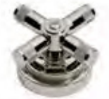
PN Polished nickel