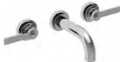
V7K17-1LF (illustrated) V7K17-1XF (with cross tops) Spout = 140mm long