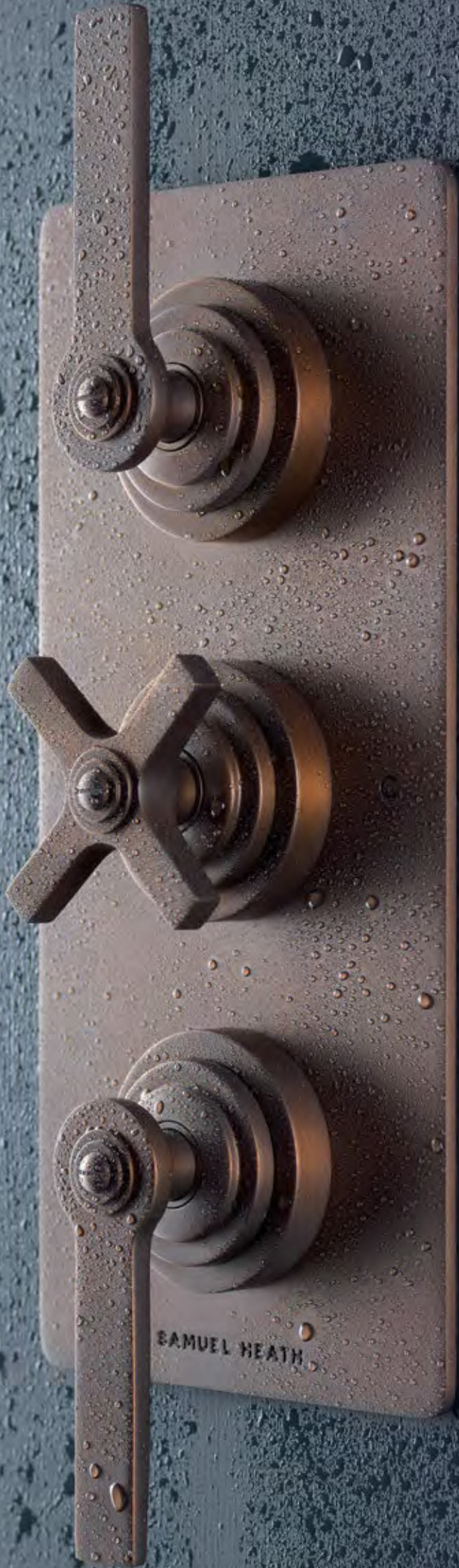
V702-TLF Thermostatic shower in CTB city bronze finish