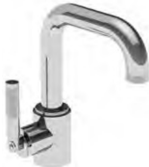
V7K09LK-LH (WRAS Approved in UK)