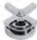
CP Chrome plate