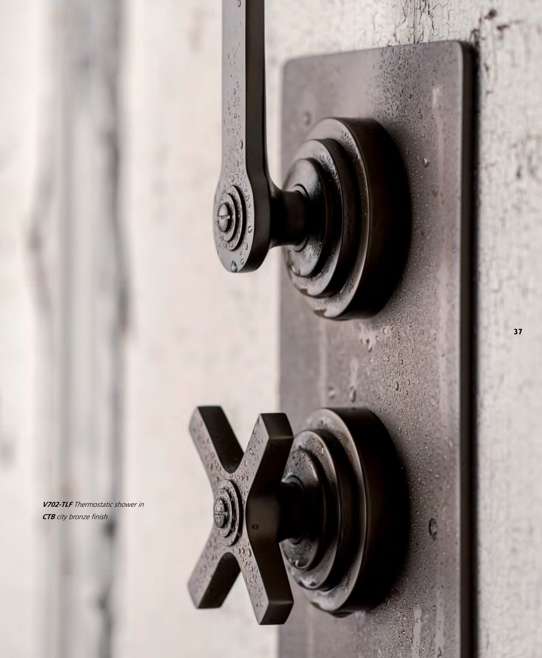
V702-TLF Thermostatic shower in CTB city bronze finish