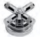
CP Chrome plate