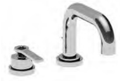
V7K13-1LF (illustrated) Low spout = 139mm high