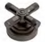
CTB City bronze