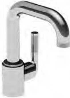
V7K09LK-RH (WRAS Approved in UK)