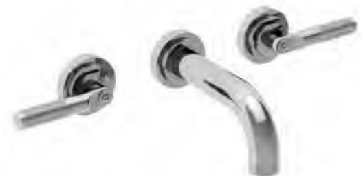
V7K17-1LK (illustrated) V7K17-1XK (with cross tops) Spout = 140mm long