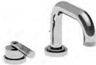
V7K13-1LK (illustrated) Low spout = 139mm high