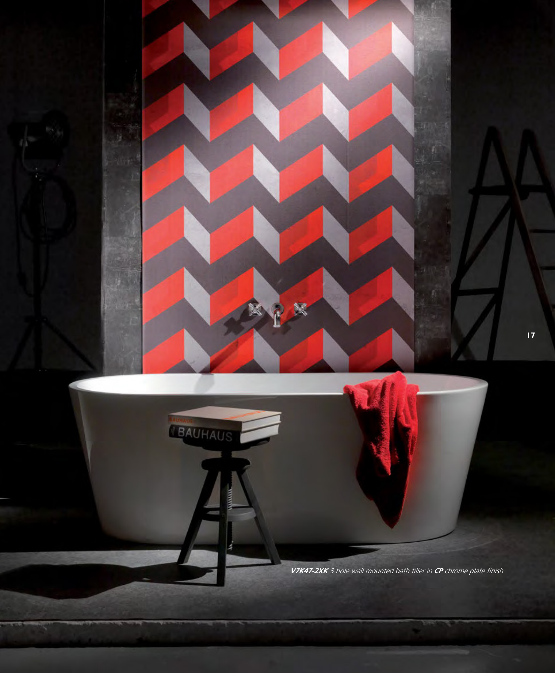
V7K47-2XK 3 hole wall mounted bath filler in CP chrome plate finish