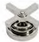
PN Polished nickel