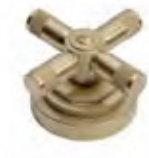
URB Urban brass