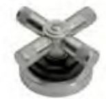
SSB Stainless steel finish with matt black chrome