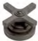
CTB City bronze