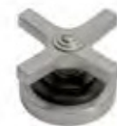
SSB Stainless steel finish with matt black chrome