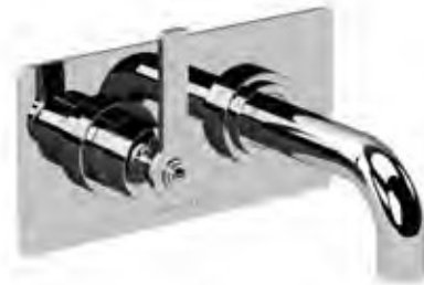
V7K20-1LF-LH (illustrated) V7K20-1LF-RH Right handed version also available Spout = 144mm long