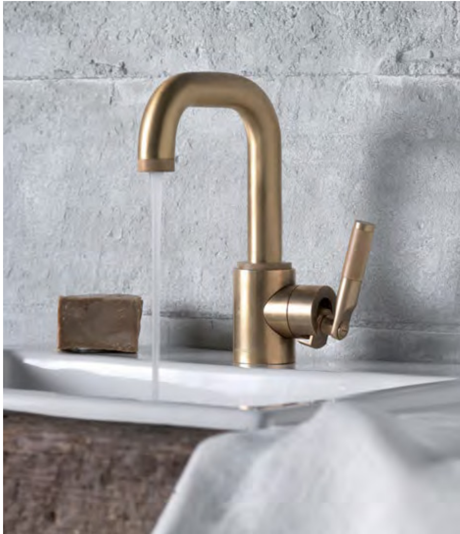
V7K09LK-RH Single lever basin mixer with pop-up waste (Right handed) in URB urban brass finish