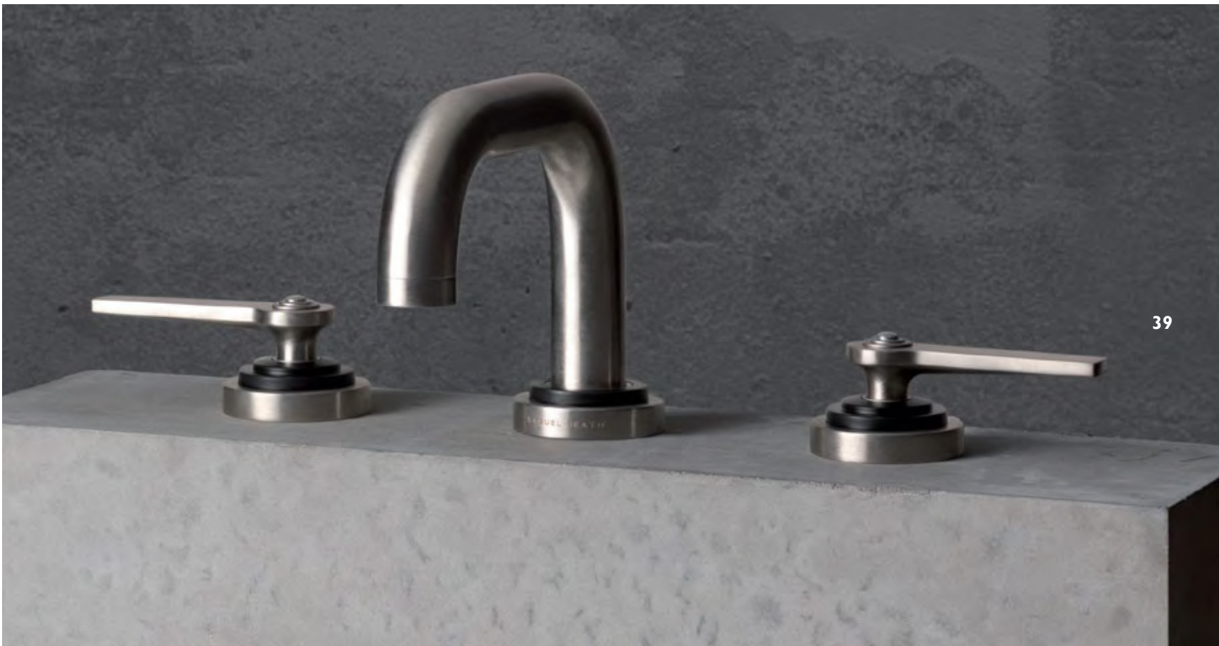
above: V7K14LF 3 hole basin mixer; low spout with pop-up waste in SSB stainless steel with matt black chrome finish