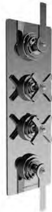
V706-TLF requires V606-IS (WRAS Approved in UK)