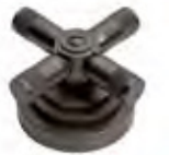
CTB City bronze