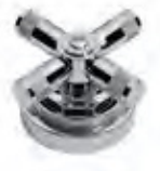
CP Chrome plate