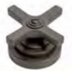
CTB City bronze