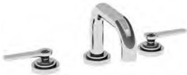
V7K14LF (illustrated) V7K14XF (with cross tops) Low spout = 139mm high (WRAS Approved in UK)