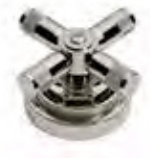
PN Polished nickel