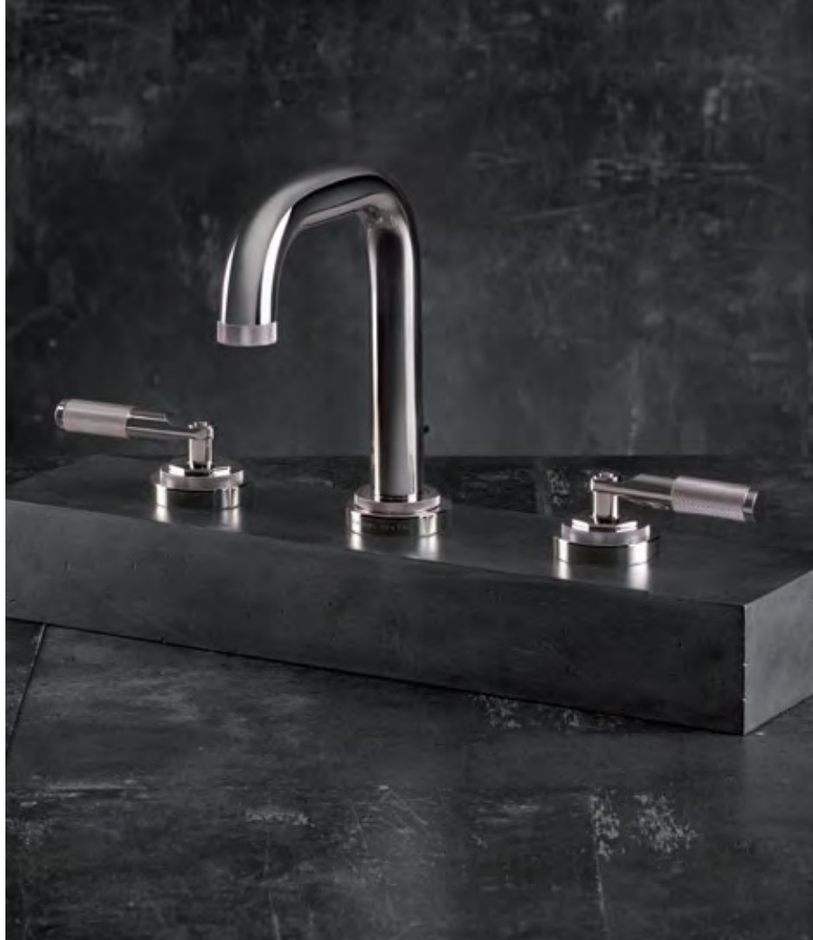
V7K15LK 3 hole basin mixer, medium height spout with pop-up waste in CP chrome plate finish