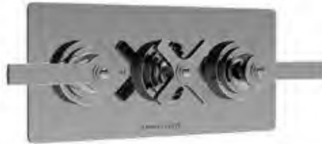
V705-TLF requires V135-IS (WRAS Approved in UK)