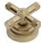
URB Urban brass